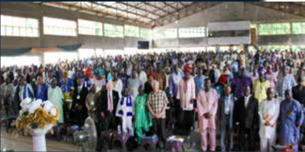
WEST AFRICA HUB