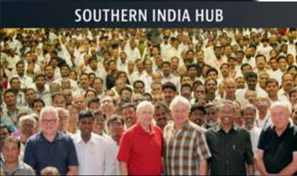
SOUTHERN INDIA HUB